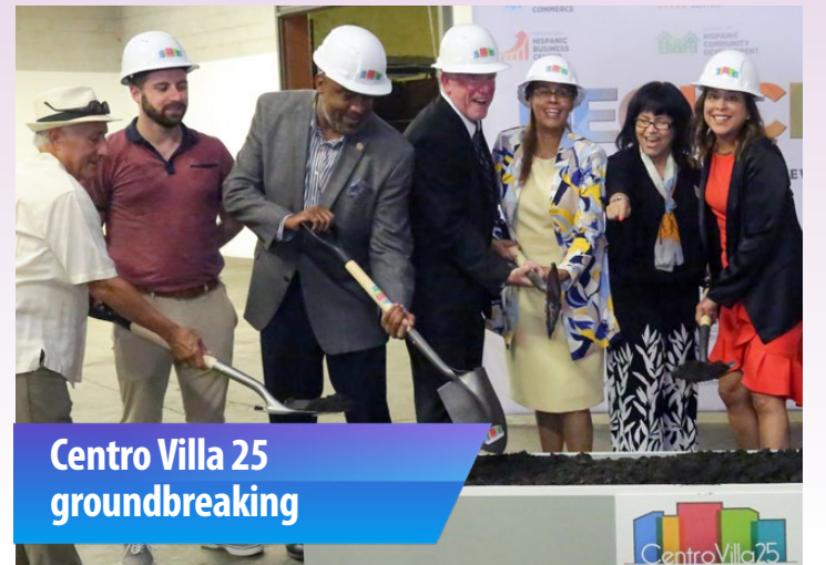
Centro Villa 25 groundbreaking