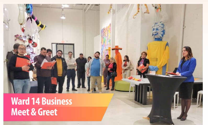
Ward 14 Business Meet & Greet