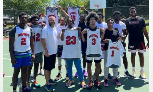
Outdoor Summer Basketball League

This past year, with the assistance of Impact Youth Sports, I was able to put together the City of Cleveland’s first ever organized outdoor summer basketball league. Over 125 people, ages 10 – 25 participated.