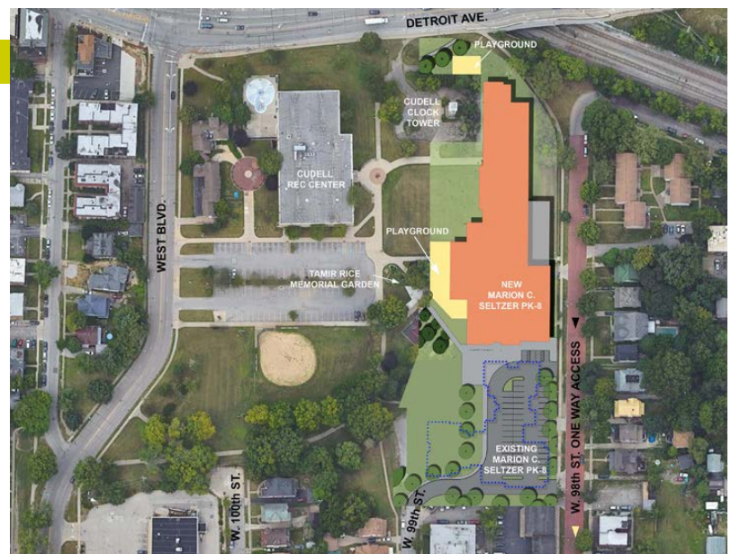
Proposed Site Plan Marion C. Seltzer PreK-8 School

If you are receiving this notice after the meeting date has passed, a record of the meeting can be found at www.clevelandmetroschools.org/Segment8