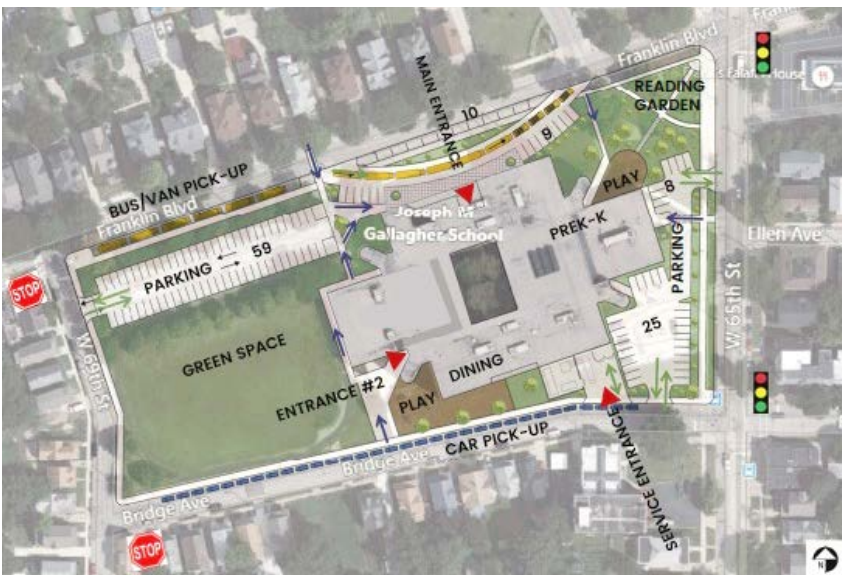
Proposed Site Plan Joseph M. Gallagher PreK-8 School

Long-awaited school improvements are finally here! Through its “Segment 8” capital improvements process , Cleveland Metropolitan School District (CMSD) will renovate Joseph M. Gallagher PreK-8 School and build replacements for Clark and Marion C. Seltzer PreK-8 Schools. CMSD’s Segment 8 website, www.clevelandmetroschools.org/Segment8 , includes site plan details, designs and meeting notifications for each school.