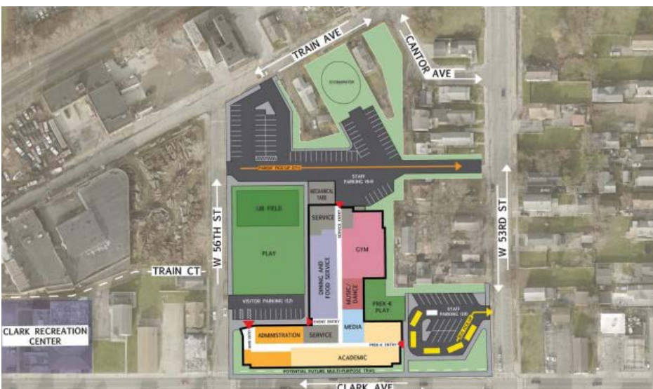
Proposed Site Plan Clark PreK-8 School