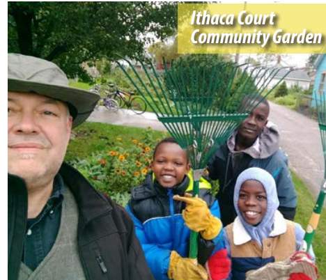
Ithaca Court Community Garden

You don't have to be a gardener to come to enjoy this corner