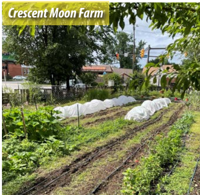
Crescent Moon Farm

This garden is easy to spot with its 70-foot, beautifully painted mural along the edge of the property leased from the City Land Bank. Gardeners here cultivate with a method known as "lasagna