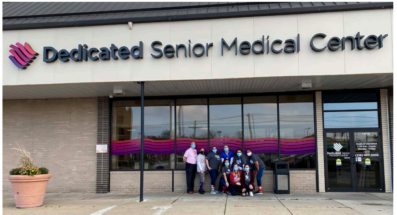
Some staff members at the newly opened medical clinic in Ward 16 gather (wearing masks) for a group photo. The clinic, Dedicated Senior Medical Center at 13719 Lorain Ave., is devoted to caring for seniors who are eligible for Medicare.