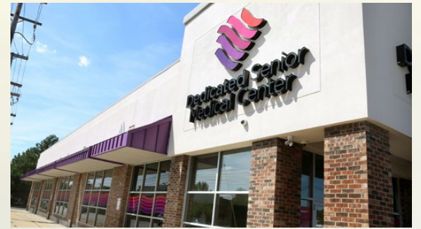
The new Dedicated Senior Medical Center at 152nd and St. Clair Avenue. Story on page 3.

This summer was a challenging one. However, I am proud of how our Ward came together to support each other and offer many community-facing programs. At the Northern Ohio Recovery center thousands of people received free pantry items, toiletries, and produce over the course of the summer. Five Pointe Community Center continues to prepare meals for our senior residents. Several different mural projects across the ward continue to beautify our neighborhoods into communities that welcome all people. From