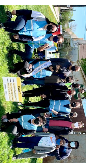
NNDC staff, board members and volunteers during the spring 2021 community clean up.

The board of directors and staff of Northwest