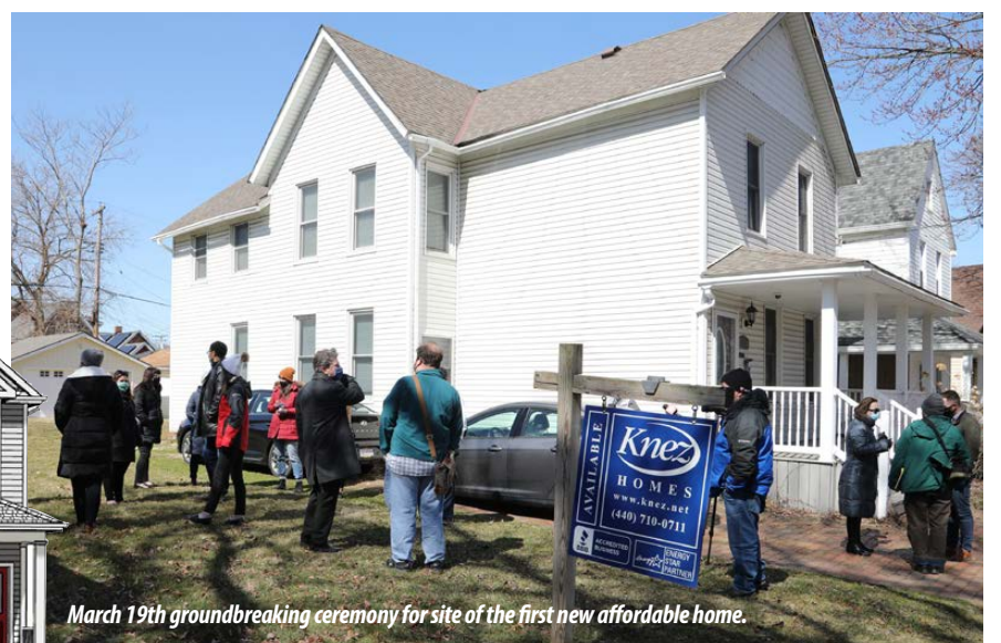
March 19th groundbreaking ceremony for site of the first new affordable home.

eventual sale price, with owners capturing 35% of increases in home equity at sale, while the remaining equity stays to keep the home affordable to the next buyer.