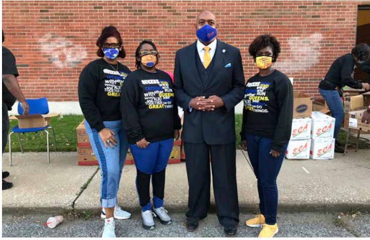
LEFT: Sigma Gamma Rho Sorority members distributed turkeys in Fairfax.