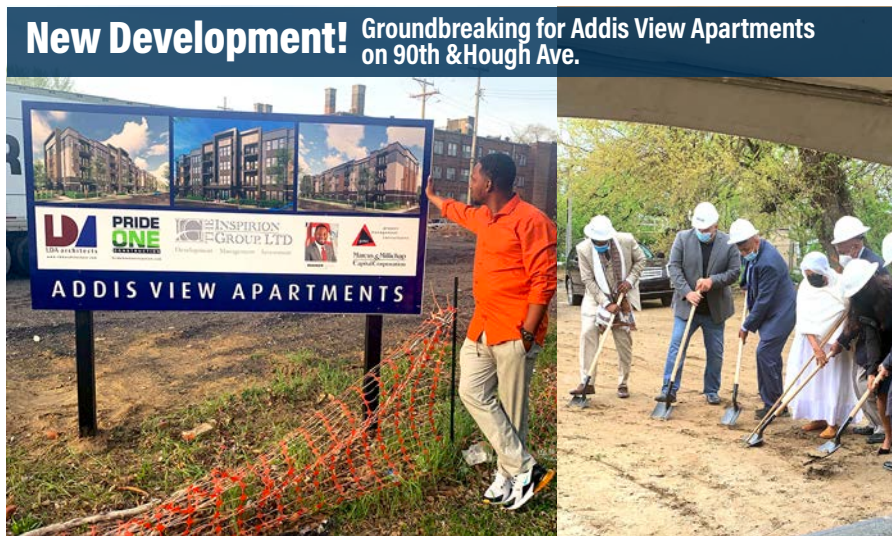
New Development! Groundbreaking for Addis View Apartments on 90th & Hough Ave.