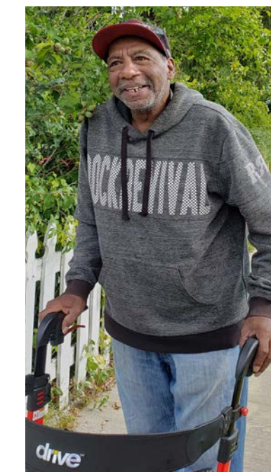
Recently connected Hough resident looks on as the EmpowerCLE installation team finishes his connectivity.