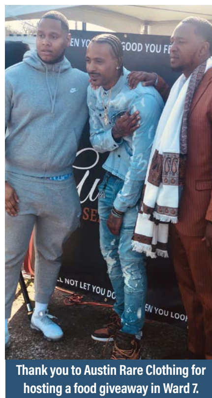
Thank you to Austin Rare Clothing for hosting a food giveaway in Ward 7.