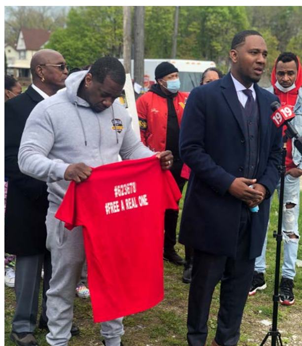
The Councilman speaking at a press conference for a resident who has been falsely accused of a crime and has spent 12 years fighting his case. We must stand up for the voiceless!