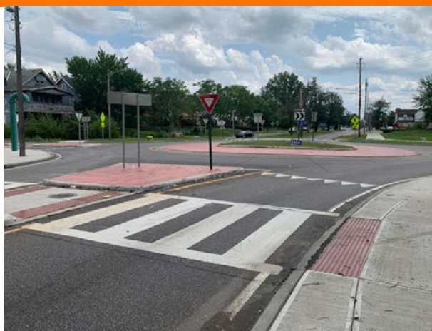
Roundabout - (pictured above and below) E. 116th and Miles to Union at the intersections of E. 116th St./MLK/ Farringdon