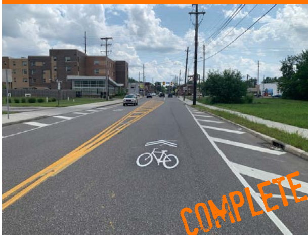
E. 131st & Miles