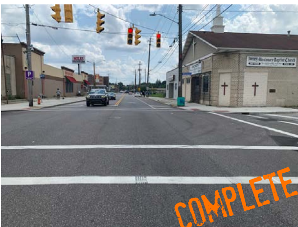
E. 131st & Marston