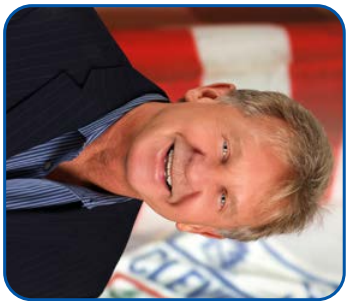
WARD 11 COUNCIL MEMBER

PRESORT STD. U.S. POSTAGE PAID CLEVELAND, OH PERMIT NO. 2893