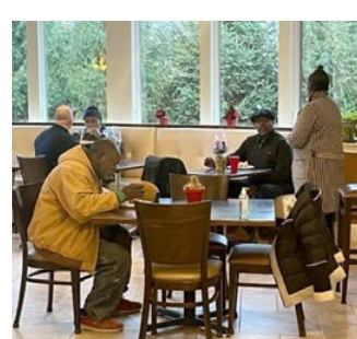
Miceli Dairy Products Company Holiday Celebration held on December 16, 2022