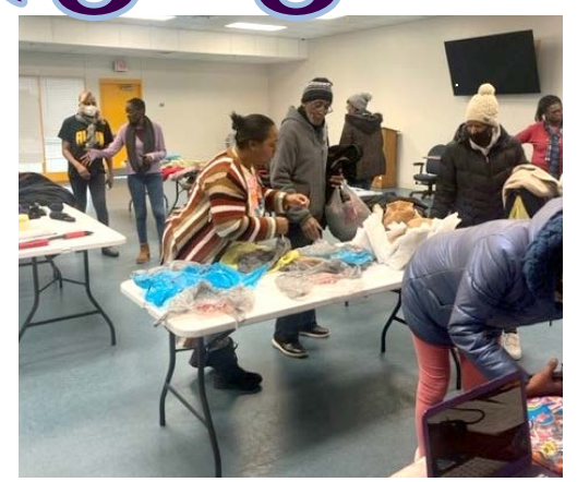
Coat Giveaway held on December 22, 2022 at Zelma Watson George Recreation Center