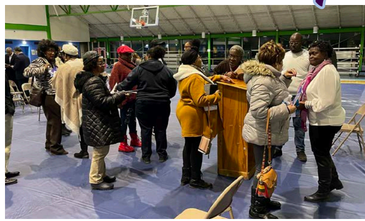
Ward 4 New Year Community Meeting held on February 1, 2023 at Zelma Watson George Recreation Center.