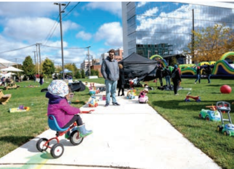
Images from the Glick Center Dedication and Community Day.