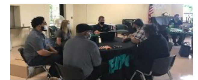
Ward 1 Job Fair on June 26 – Participating companies: Smedley Global Logistic, Cross Wash Mobile Spa Treatment, Wingstop, Dave's Supermarket, Tremco, ELITE HOME HEALTH SERVICES, LLC, and RTA.